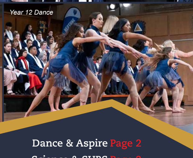
Year 12 Dance